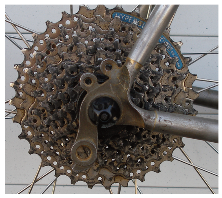
I think this is one of the 36t Shimano cassettes. That's the dropout. We'll probbly add another eyelet about an inch above the top one there. It will help rack-mounting with big tires. We'll see. No promises, and the decision will be made according to something other than money.

This shows the new lugs used for the second TT. Up to now, they've been made by carving up other lugs. This way is no better, but way less hassle, makes more sense. I like the gangly arm-y look of big bikes with relatively skinny tubes. Structually, it makes sense. The wall tubes don't have to be so thin to save weight. That makes them more prone to denting. These are thin enough.