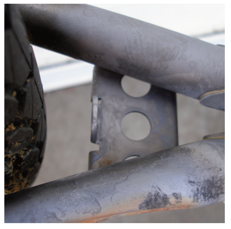
Kickstand plates double as chainstay bridges. All our bikes except the Roadeo gets 'em now.

Seat lug. This one has an external seat stay cap, and horrors, it's not even our proprietary model. IT's still cast, still made by the same...and apparently it's a better fit with the double-tapered seat stays (thickwalled) than our plug is. So, we'll go with it. Prolly.